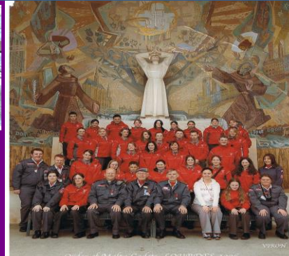
Order of Malta Cadets

I have 19 years service in the Order of Malta serving my local community. In the Order of Malta I have learnt first aid skills which I now teach to cadets aged 10-15. Empowering young people with the skills and knowledge needed to assist someone who is ill or injured builds up confidence and the young person feels they have done something worthwhile. These skills have allowed me to assist a number of people, most recently in March 2015 I assisted at a scene where a pensioner was knocked down in an accident. I have accompanied cadets to Lourdes, France where they assisted sick pilgrims. I have attended Lourdes on 2 other occasions with the Order of Malta and worked in the Accueil Notre Dame which is the hospital in Lourdes. I currently manage the cadet unit in my area organising activities, community engagement and other life skills sessions. At this present time, I am training the cadets to participate in Regional first aid and home nursing competitions. In the heavy snow of 2010 we called to the homes of local pensioners ensuring they were ok. Some of the projects I have ran with cadets include sign language, helping at home, assisting with ADLs, camp craft, anti-bullying and drug awareness amongst others. I strive to be a source of support for these young people and also a good role model. It is my hope that if I can be One Good Adult, for these children, I can make a difference.